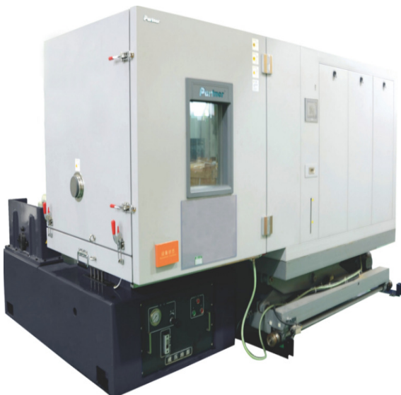
Integrated environmental testing