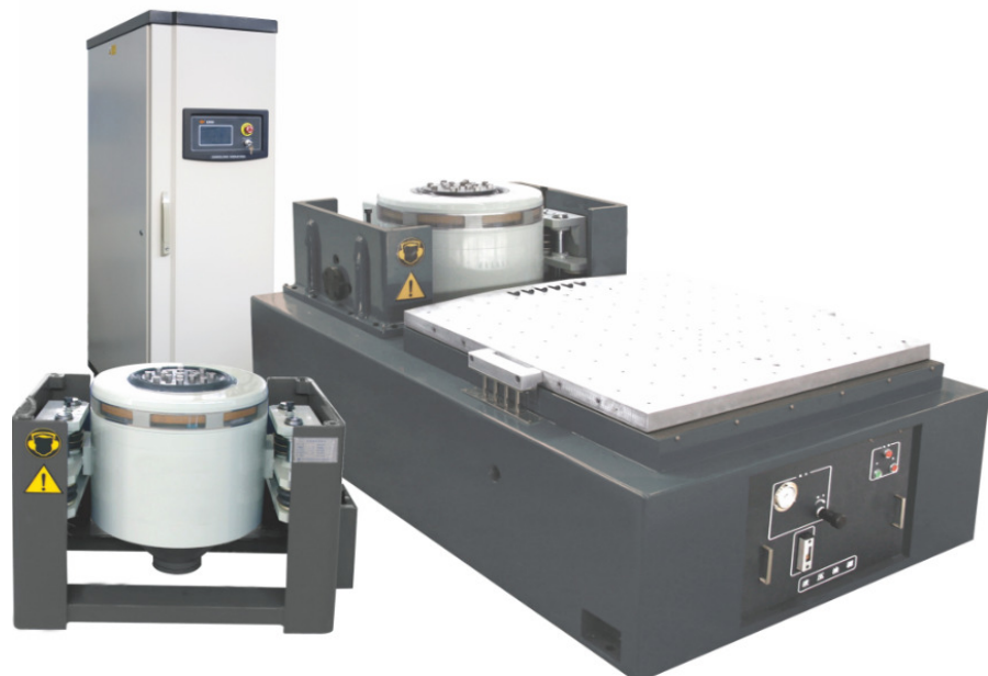
Two Shakers with one Amplifier

Complete Instrumentation Solutions Private Limited Suite 511, Suncity Business Towers, Golf Course Road, Sector-54, Gurgaon- -122002, Haryana, India Tel:+91-124-4929000 ; Fax:+91-124-4929010 info@instrumentation-solutions.com www.instrumentation-solutions.com